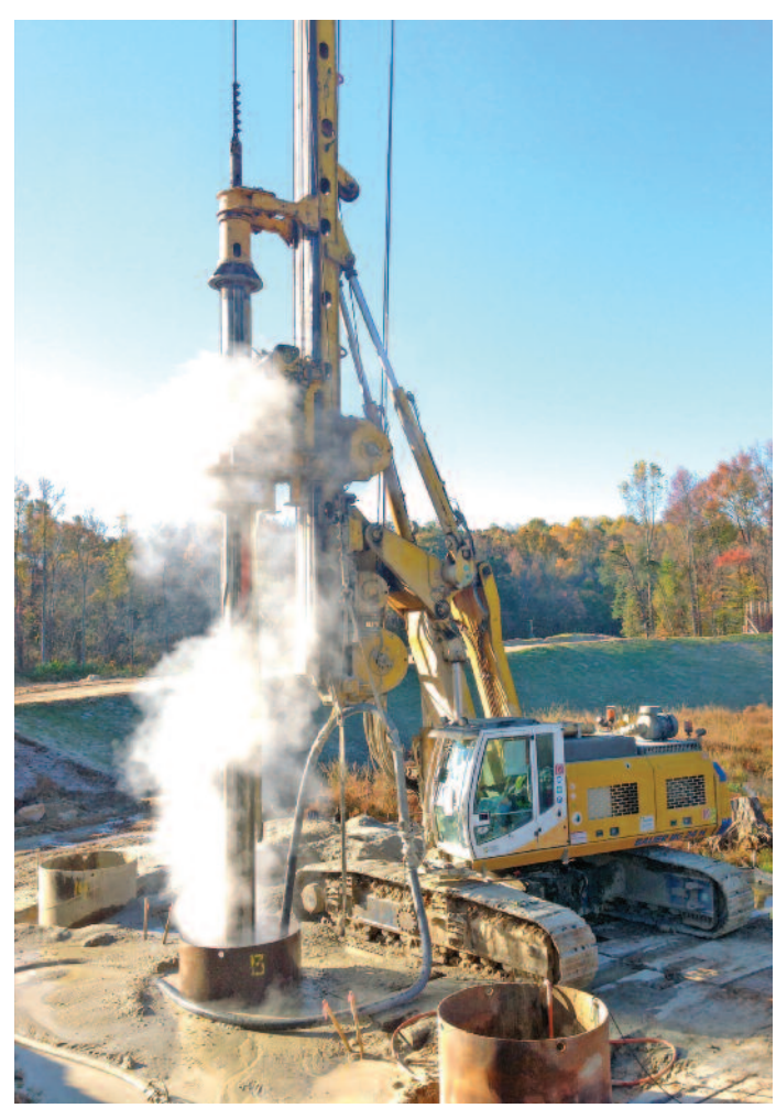
LP Cluster Drill in action.

tiple 1600 cfm compressors were required to operate the tool efficiently.