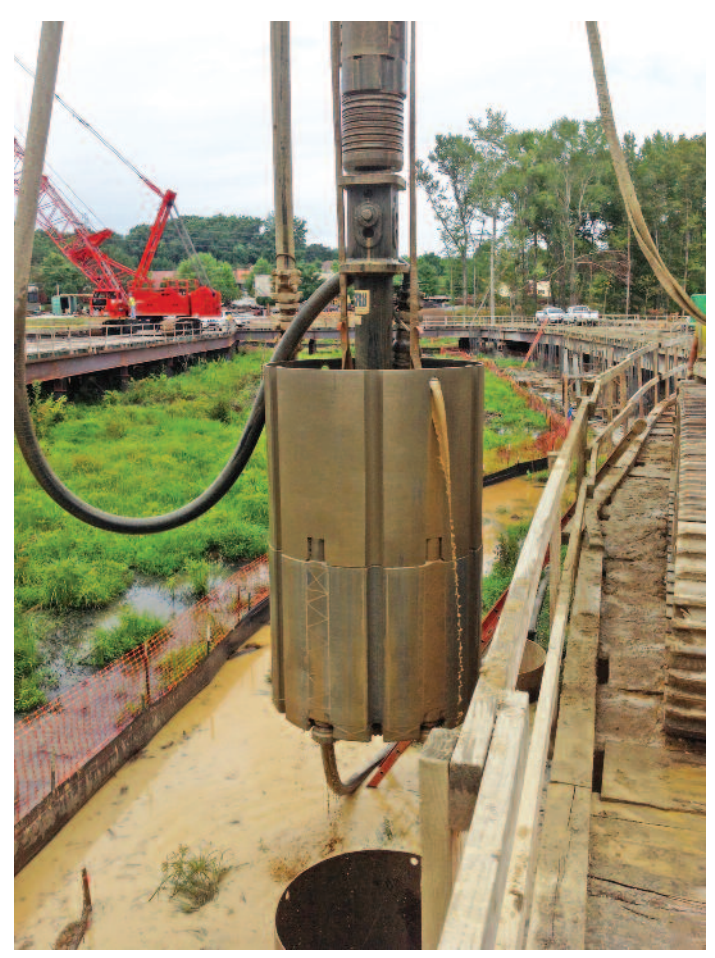
LP Cluster Drill.

The 60 inch LP Cluster Drill was designed and built by Center Rock, Inc.* of Berlin, Pennsylvania and fitted with thirteen low volume 6 inch class self-rotating 7.875" hammer bits positioned in a specially designed grid pattern to ensure even cutting across the face of the hole and to promote proper flow of cutting outward and upward into the calyx basket. The minimum air requirement to run the LP Drill is between 5200-6500 scfm at around 120 psi. Due to the head pressure from the swamp mul-