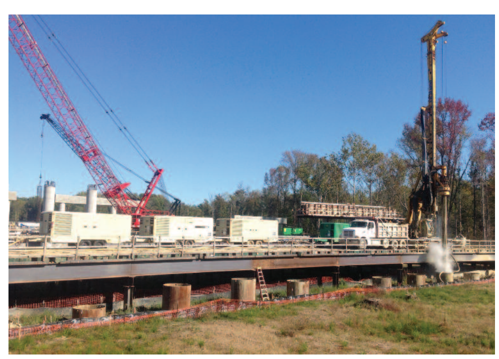
Cluster drilling on temporary work bridge in Horse Pen Creek wetland.