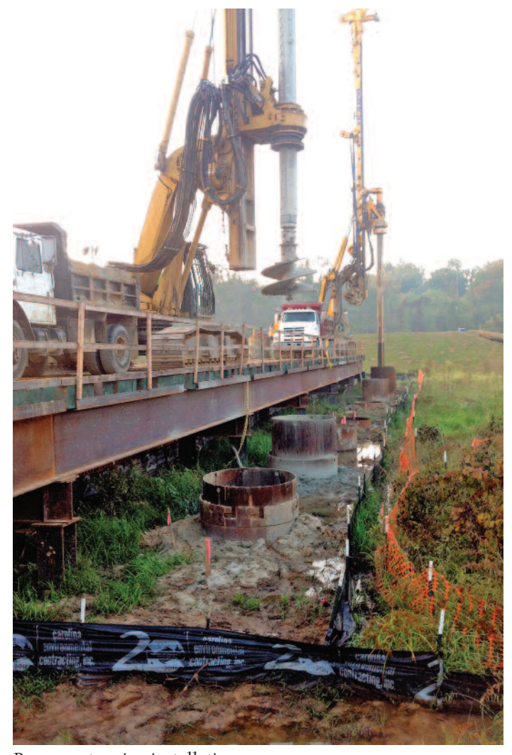
Permanent casing installation.

meet EPA standards for biodegradability due to sensitive site location.