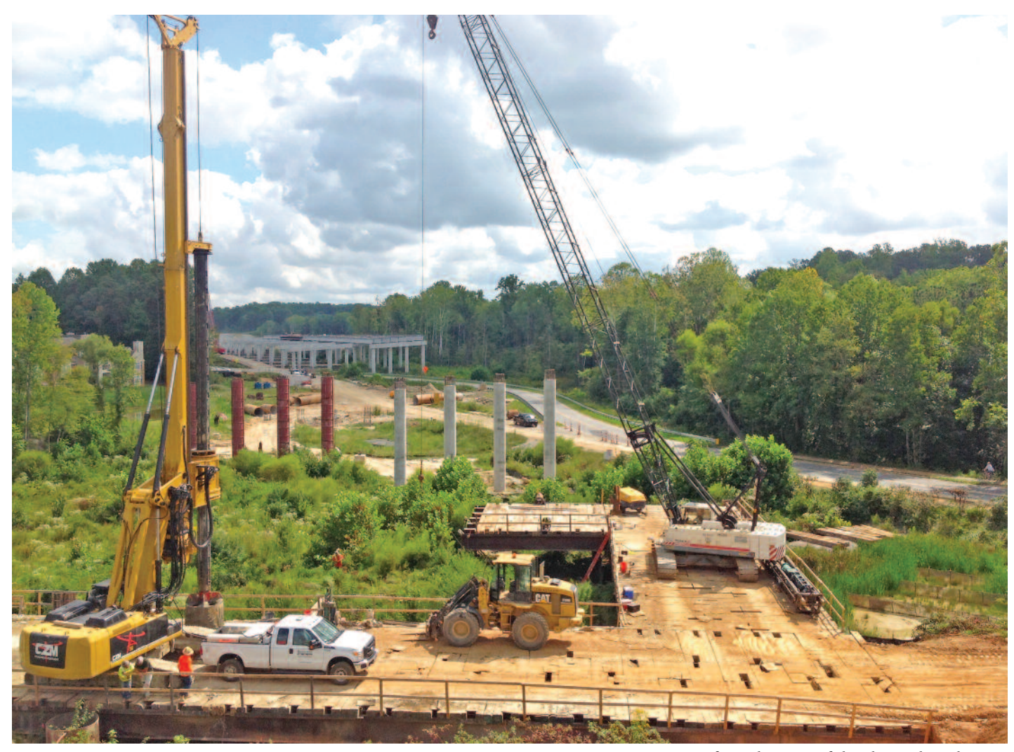
View from the start of the elevated roadway.

and the columns and drilled shafts below needed to be completed prior to excavation. To solve this problem an oversized 72 inch temporary casing was installed to act as shoring at each